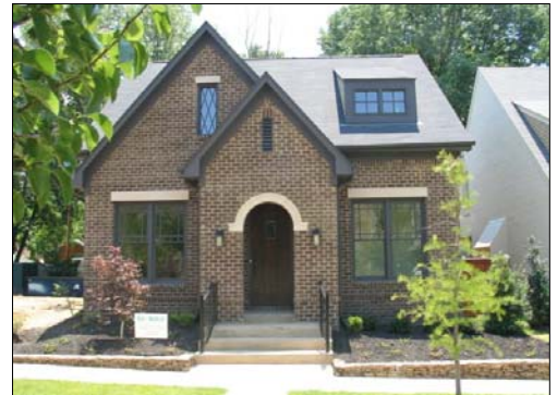
This Midtown house made history as the 500 th EcoBUILD-certified home in Shelby County.

With 514 certified homes now, EcoBUILD is by far the largest green building program in Shelby County, accounting for 667,797 square feet of local green housing. Based on average energy savings identified in the 2006 Uptown study, MLGW estimates these EcoBUILD homes represent a collective annual electricity savings of 2.3 million kilowatt-hours (kWh), plus natural gas savings of 267,000 hundred cubic feet (Ccf.). The avoided electricity use is enough to meet the annual power needs of 146 average Memphis households. This also represents avoided power generation emissions equal to 3.76 million pounds of carbon dioxide. MLGW plans to repeat the energy savings study, sampling a larger number of homes and using 2009 data, early next year.